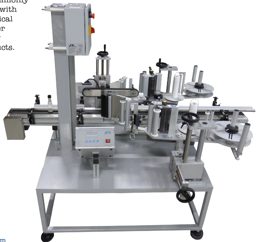
ALbelt E Side Panel/Elliptical Product Labelling System

Although the performance of an ALbelt E machine is far beyond that of a desktop machine, the requirement for continuous motion (usually in the form of a conveyor) to label the product types discussed means that viable solutions of this type do not really exist, and for this reason an ALbelt E machine is often an entry level, 'first machine' solution.